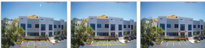
Programmable Analytics including Object Removal, Line Crossing, and Area Intrusion Detection

Transcendent Series NDAA Compliant High Definition 5 Megapixel IP Network Cameras offer unprecedented performance and value. These simple, easy to install, attractively styled, IP Network Cameras transmit over remote viewing via CMS, Internet Explorer, and iOS & Android Apps.