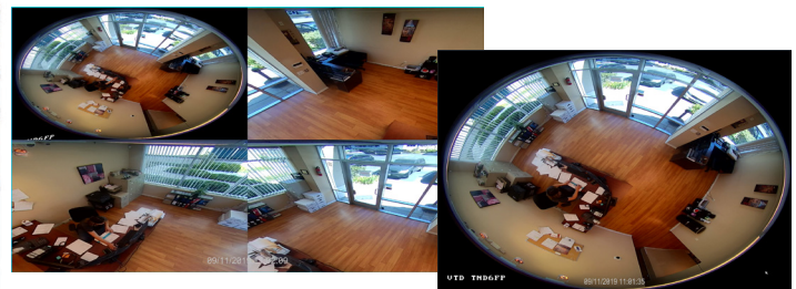
Fish Eye De-Warping: Multiple Views include 360° Overview, Double 180° Panorama View, Quad View, Overview + 3 Views, and Single View